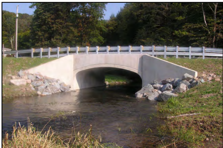
New Manchester Township bridge, owned and maintained by Wayne County