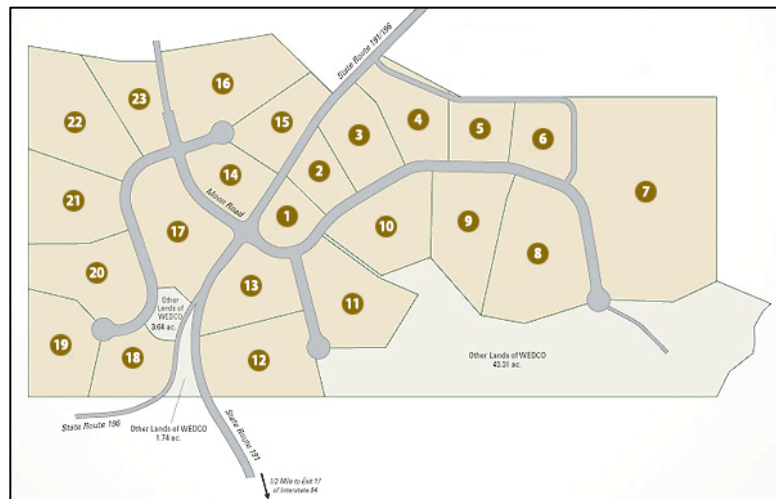
Sterling Business Park site plan