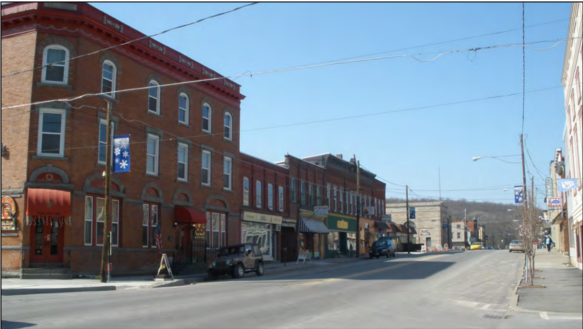
Main Street, Hawley Borough