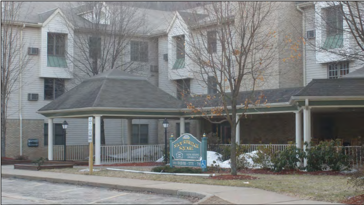
Stourbridge Apartments - Honesdale